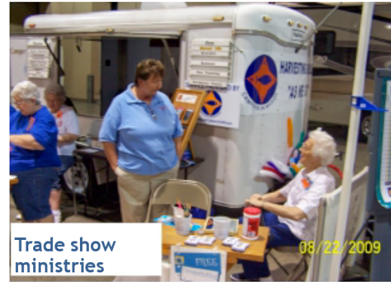
Trade show ministries

tation of reimbursements or income. They work on local projects, projects around the state, projects across the country, and some even go on international projects. The individual camper selects mission opportunities as they feel led. Some travel a little, others travel a lot. Owning an RV is optional. Many mission opportunities have facilities or a place the volunteers can sleep.