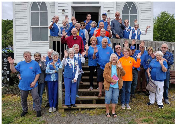
Spring 2023 Rally