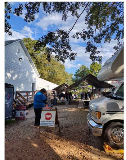
NC State Fair 2023