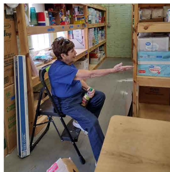
Kennedy Children's Home Pantry