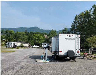
Black Mountain Children's Home Campground