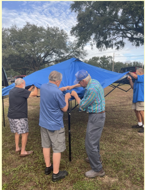
North Florida Fair