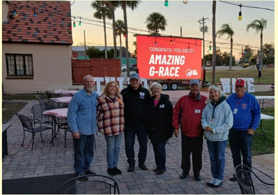
Lake Placid Camp and Conference Center